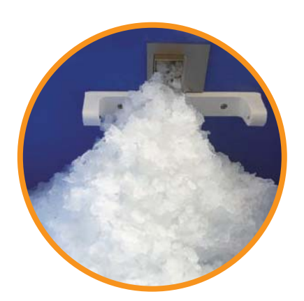
制冰颗粒实拍 Ice making real shot